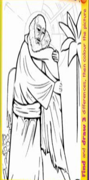
Find and draw 3 differences, then colour the picture

Write a promise & draw a big smile on Smiley