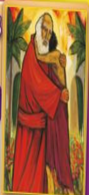
Sunday Gospel Gallery Look at this Sunday's Gospel picture. What can you see? How do you feel? What does it make you think about?

Which word or words stood out for you in this Sunday's Gospel, and why? Spend a few relaxing moments pondering the picture together. Share any thoughts before moving on.